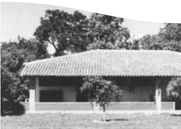
Left: Fénix, Lagoa Santa, Brazil; right: Christianopolis, Birnbach, Germany.

At this psychological moment God spoke to him: 'Why have you become angry and why has your countenance changed? Is it not so? If you are devout, you are acceptable, but if you are not devout, sin is crouching at the door. Do not leave it its will, but you must master it.' Well, this fire human being, this powerful one, must understand that he cannot ignore the soul, that although he is superior, the all-encompassing and conscious one as to the spirit, yet, like Abel, he must be the silent, devout and pious one as to the soul, who in humility folds his hands in yearning worship. Why, we ask? Doesn't Cain have a heart, doesn't Cain have a soul life? Is the opposite not proven